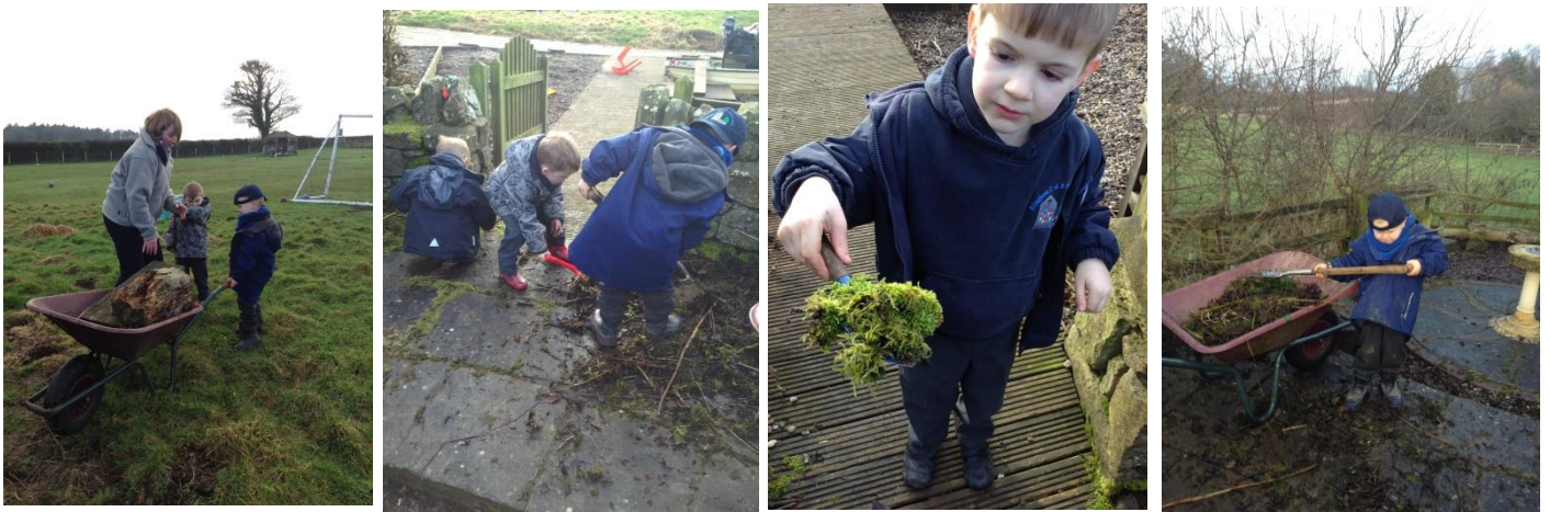
Making our wildlife area.....clearing the space was hard work!